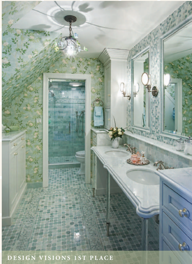
DESIGN VISIONS 1ST PLACE