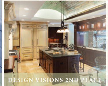
DESIGN VISIONS 2ND PLACE