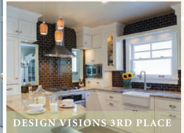
DESIGN VISIONS 3RD PLACE