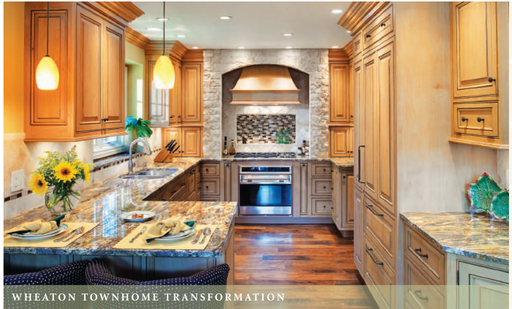
WHEATON TOWNHOME TRANSFORMATION

“Drury’s operation is very good at working at a higher level. We love partnering with Drury; we share that view of work and we achieve it together. We also share the view of providing reliable production schedules, which requires a great deal of effort, communication and work. It’s always easier to help someone achieve when you have shared values.