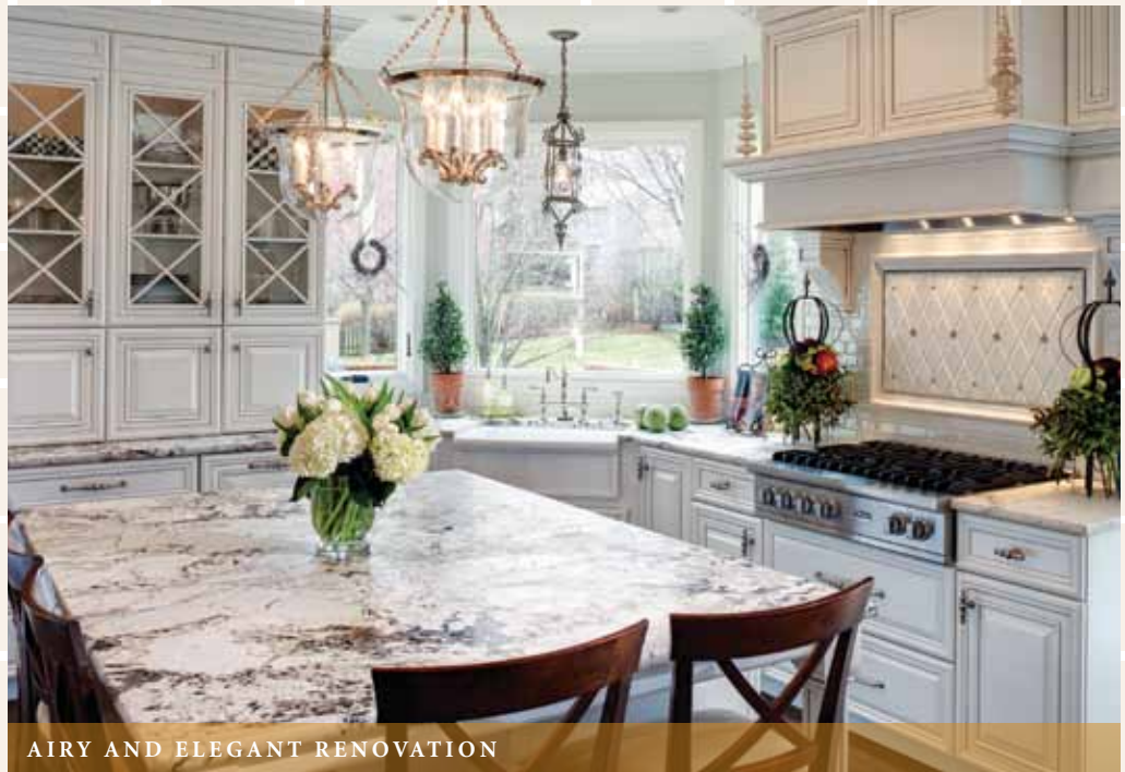
AIRY AND ELEGANT RENOVATION

Our designers have a trained eye; they know how to infuse inspired details into our clients' custom designed spaces. As you contemplate your next project, look around your home and discover the most memorable details...and think about what inspires you. Let us be the muse that brings inspiration into your new kitchen or bath.