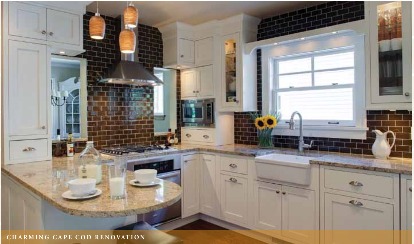
CHARMING CAPE COD RENOVATION