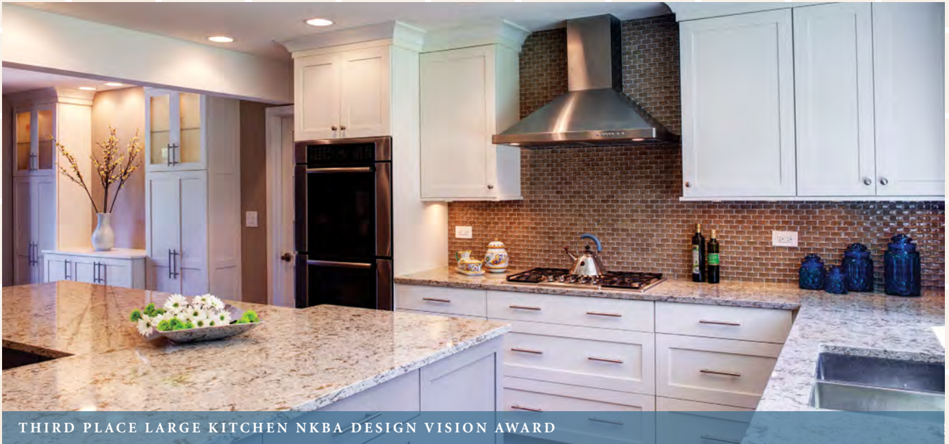
THIRD PLACE LARGE KITCHEN NKBA DESIGN VISION AWARD