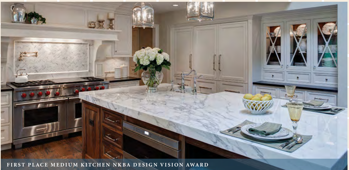
FIRST PLACE MEDIUM KITCHEN NKBA DESIGN VISION AWARD