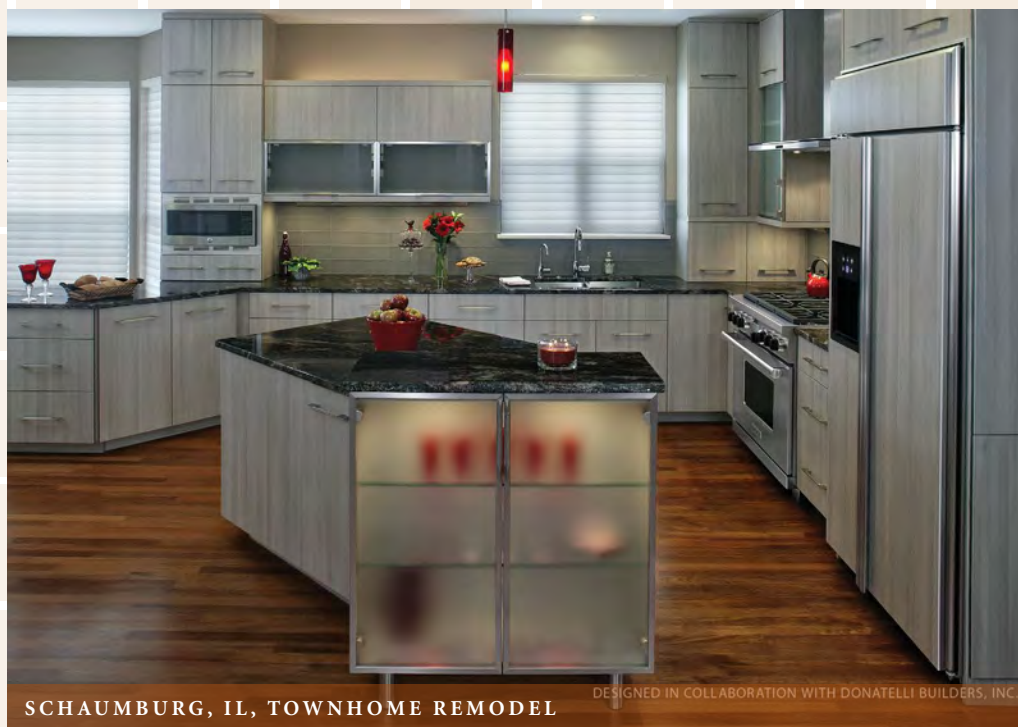
SCHAUMBURG, IL, TOWNHOME REMODEL

As we enter our 28th year in business, we'd like to thank our clients, our team, and the community for being our partners. And, we'd like to invite you to become a Drury Design client. What projects do you have in mind?