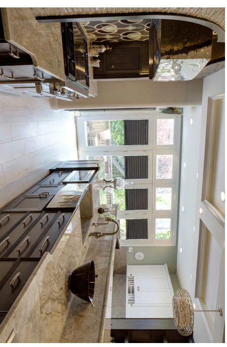
Drury Design Kitchen & Bath Studio | Glen Eilyn, IL