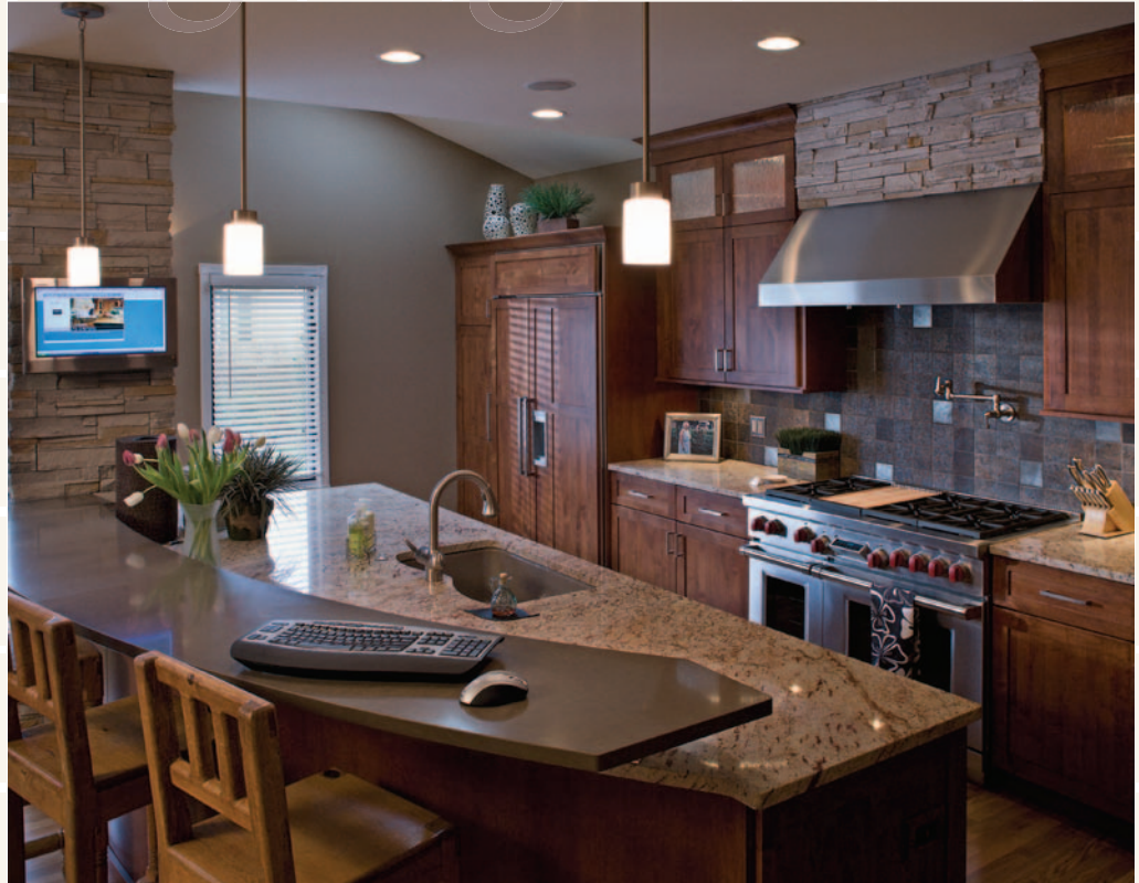
HI-TECH AT HOME IN A NATURAL SETTING

Does your kitchen need a revitalization? If so, we hope you'll join us at this year's Glen Ellyn Kitchen Walk on October 5. And, feel free to browse our online portfolio at www.drurydesigns.com .