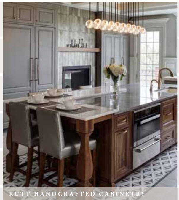
RUTT HANDCRAFTED CABINETRY

Cooking for a family of five, along with preparing food for large family gatherings, made it essential to have the proper appliances and island work space. A long, two-tiered island houses seating for five while it provides plenty of countertop space. Sitting down for meals, doing homework, or prepping a large meal is more functional and inviting.