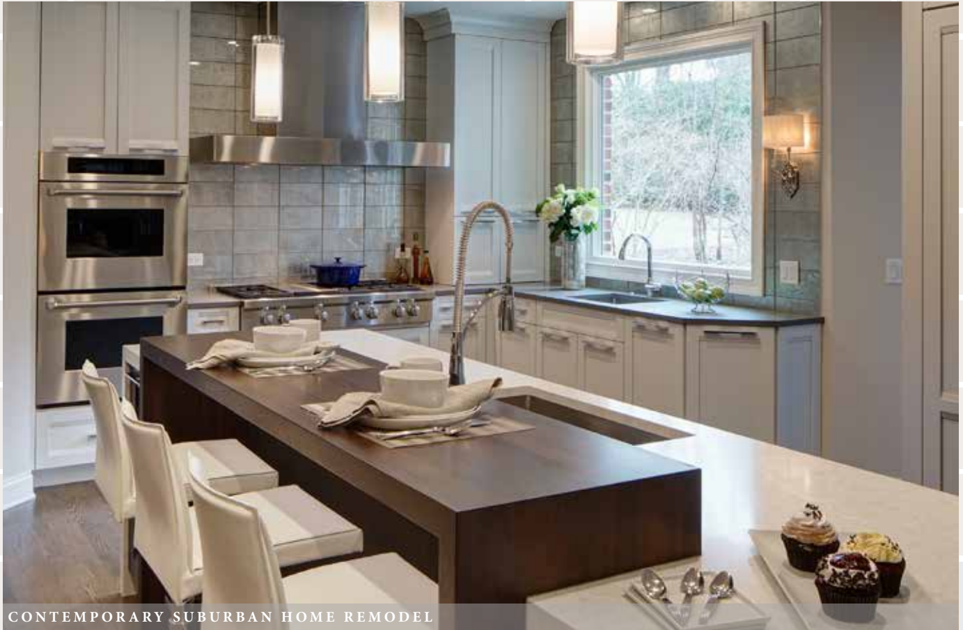
CONTEMPORARY SUBURBAN HOME REMODEL

Location: Glen Ellyn, Illinois Designer: Gail Drury, CMKBD Project: Kitchen Remodel Goal: Reformat footprint and revitalize function into a distinctive two-cook kitchen Solution: Before, this kitchen was dark and outdated with a troublesome traffic flow. Gail reformatted the original footprint around a large two-tiered island, which stands out as this renovation's focal point. A raised Grothouse walnut bar with waterfall ends adds a welcoming touch as it conceals the countertop work area.