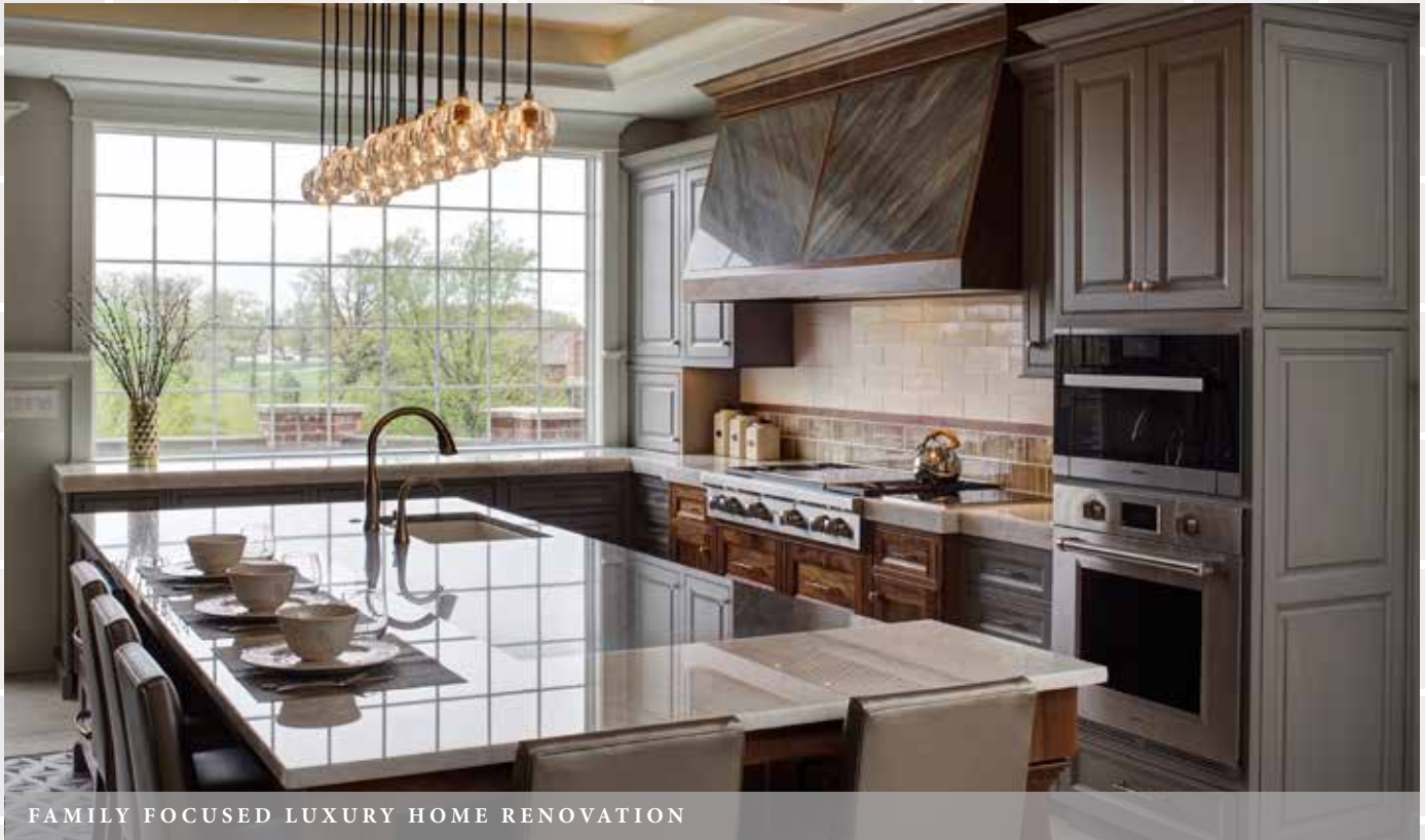
FAMILY FOCUSED LUXURY HOME RENOVATION