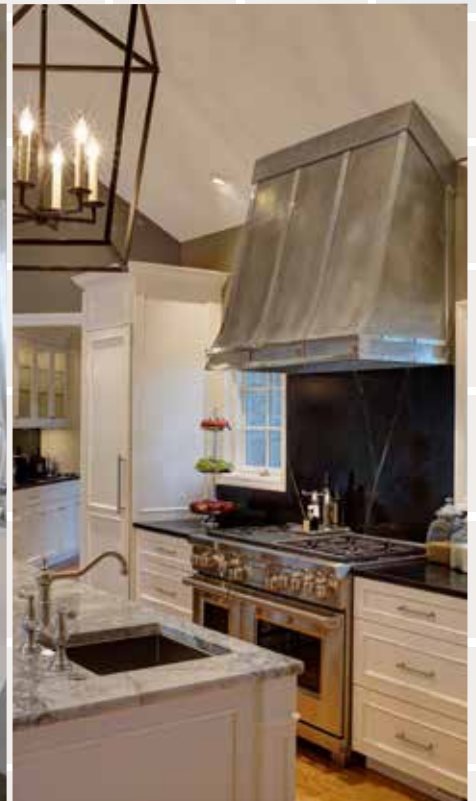
FEATURED PROJECTS IN GLEN ELLYN AND BARRINGTON HILLS