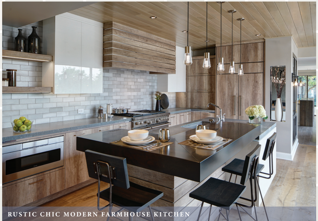
RUSTIC CHIC MODERN FARMHOUSE KITCHEN

Looking for ideas or have questions on how to renovate your kitchen or your whole house? Set up a studio tour. Our award-winner designers will introduce you to the latest in cabinetry, appliances, and design. Take a test drive today!