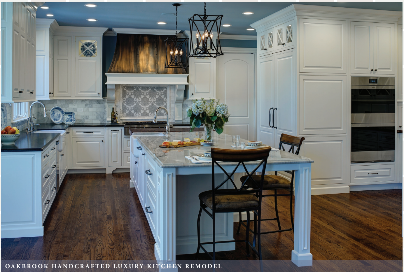
OAKBROOK HANDCRAFTED LUXURY KITCHEN REMODEL

Plenty of storage wraps around the room and hides every small appliance, leaving ample spare countertop space. Large openings into the family room and solarium allow guests to easily come and go without halting traffic.