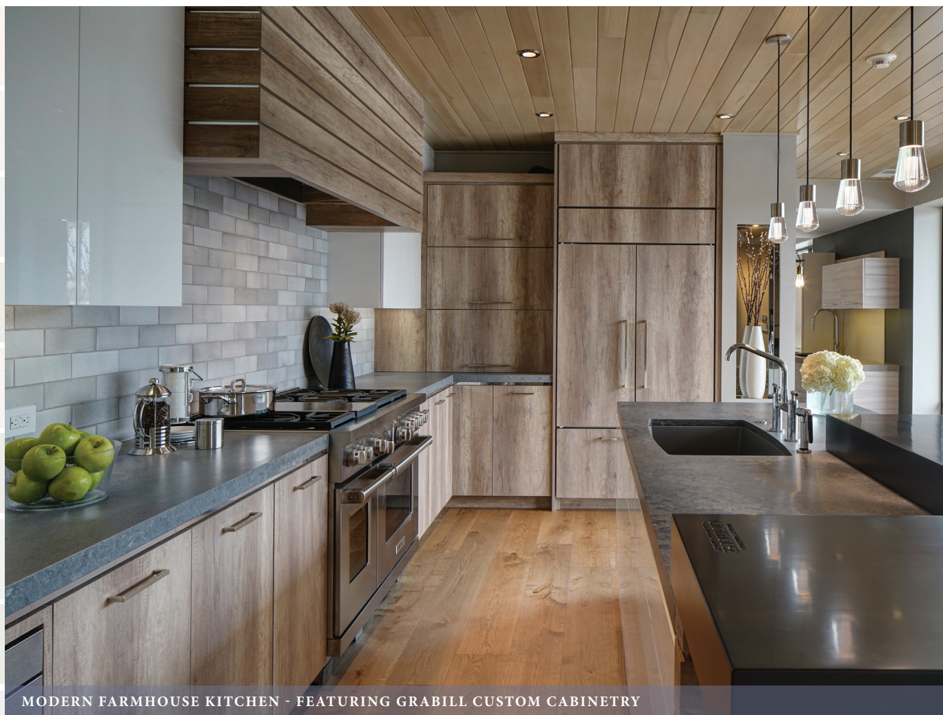
MODERN FARMHOUSE KITCHEN - FEATURING GRABILL CUSTOM CABINETRY

“This is a real practical kitchen that works effortlessly. Even if a person is not organized, this kitchen is organized for you.”