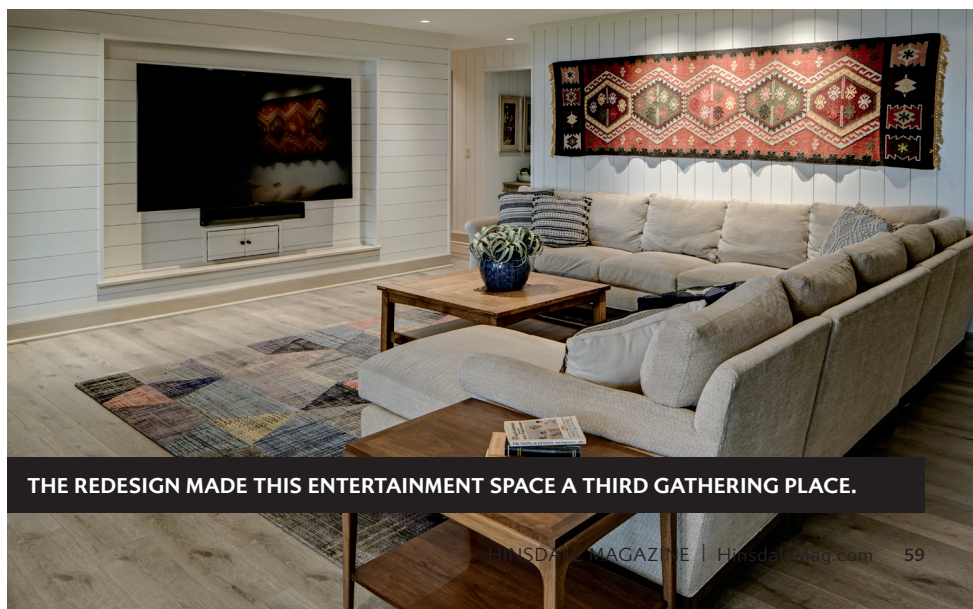
THE REDESIGN MADE THIS ENTERTAINMENT SPACE A THIRD GATHERING PLACE.