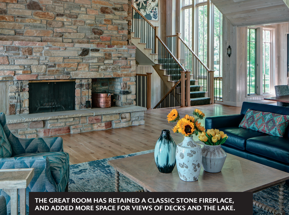
THE GREAT ROOM HAS RETAINED A CLASSIC STONE FIREPLACE, AND ADDED MORE SPACE FOR VIEWS OF DECKS AND THE LAKE.

for up to 20, and spacious to allow for many cooks (and cleaners) in the kitchen. Decks are expansive for leisure and play